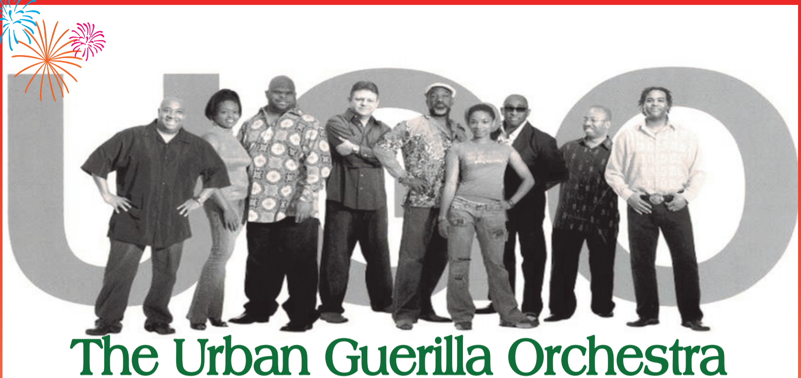
The Urban Guerilla Orchestra